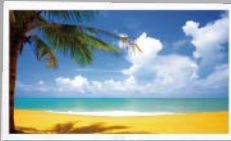
AOC Anti-Blue-Light Display AOC ABL technology filters 90% of harmful blue light, while still maintaining high color accuracy.