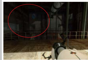
Shadow Control Default 50

With AOC Shadow Control, gamers can dial-in shadow levels in the OSD Menu to increase contrast for better dark area definition without affecting the rest of the screen.