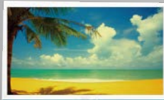
Regular Anti-Blue-Light Displays Regular ABL monitors also filter blue light, but this causes image discoloration.