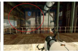
Shadow Control adjust to 80